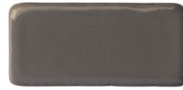
EGA-04 – GRAFITO